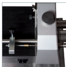
Set the cutting length.