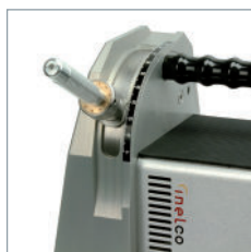
Grind the electrode in the desired angle.