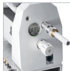
Cut the electrode by turning the handle.