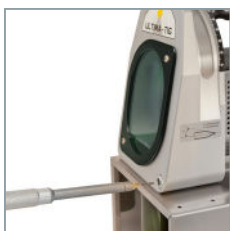
Precise adjustment of the stick-out.